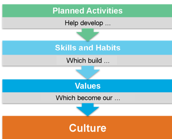
Figure 2. Steps of culture development

As revealed in Figure 2, plan specific activities becoming the elements of culture. For example, make various activities having intents such as field inspection, safety observation, safety meeting, safety contacts, and emergency drills by linking them organically a process, allocate them according to individual position and role, and make an execution plan annually. And then, repeatedly execute them, and make the members attain proficiency, and those can be habitual. As the results consistent with each activity's intent are created, the members perceive values. These values are accumulated and gathered for a long time, and place themselves