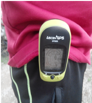
Figure 1. GPS device